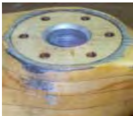
Over torqued prop hub

A crushed hub breaks the moisture seal and allows moisture to penetrate the hub, which increases hub swelling and accelerates wood rot.