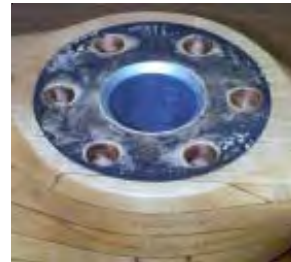
Charred prop hub

The loss of bolt torque induces heat due to the propeller rubbing back and forth on the flange when the engine fires. This results in rapid drying and shrinking of the wood and further accelerates bolt torque loss.